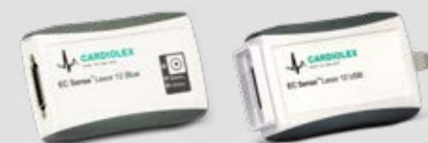
LEXOR 12 BLUE

The system controls the patient ID when connected to the ECG management system, EC Store™, in order to verify that input values are correct and exist. Depending on the country's specific ID parameters, the system can extract information from the ID and notify external systems.